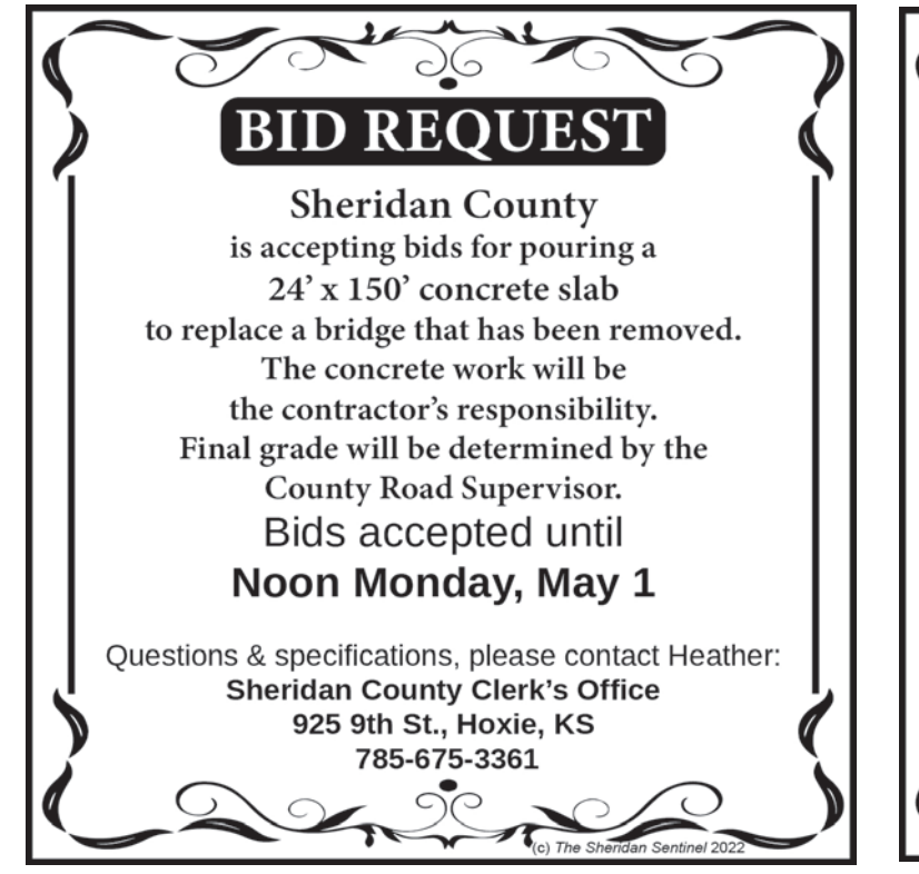
(First published in The Sheridan Sentinel March 28, 2024)