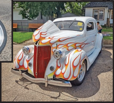
Flames on the hotrods are always a favorite.