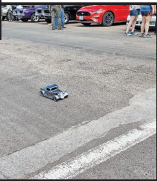
Even Mini Hotrods were showing off!