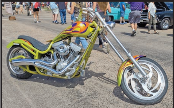
Several choppers were on display as well.