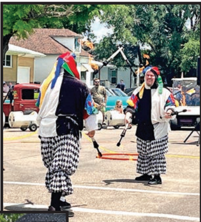
Juggling Jesters' show was entertaining for everyone!